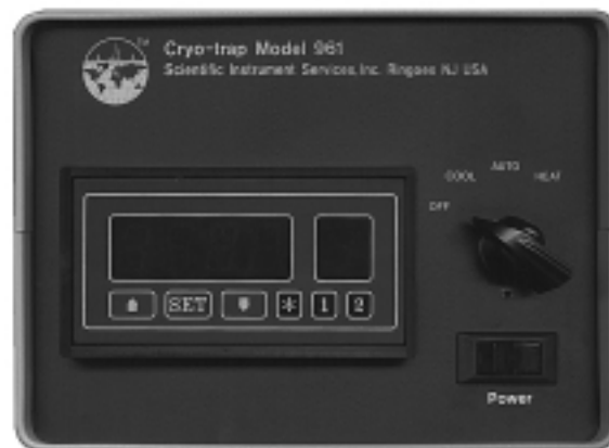
Cryo-Trap Heating and Cooling Controller