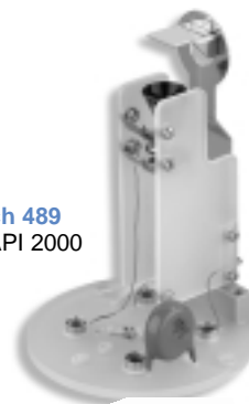
DeTech 489 EM for API 2000