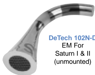
DeTech 102N-D EM For Saturn I & II (unmounted)