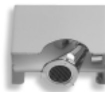
DeTech 382 EM For Saturn 2000, 2100 & 2200