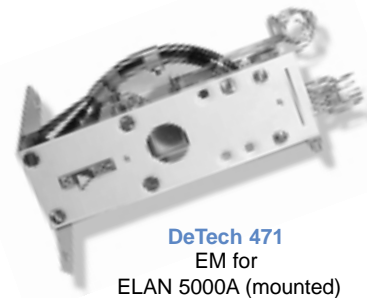
DeTech 471 EM for ELAN 5000A (mounted)