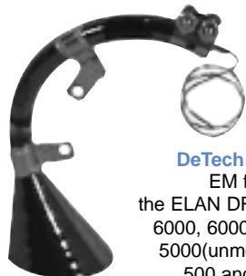
DeTech 201M EM for the ELAN DRC(PLUS), 6000, 6000A, 6100, 5000(unmounted), 500 and 250