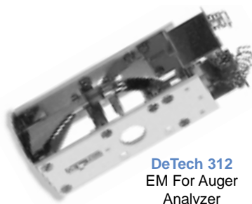
DeTech 312 EM For Auger Analyzer