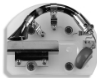
DeTech 486 EM for API 3000, 4000, 100, 200, and 300 Series