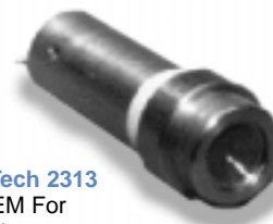
DeTech 2313 EM For Varian 1200