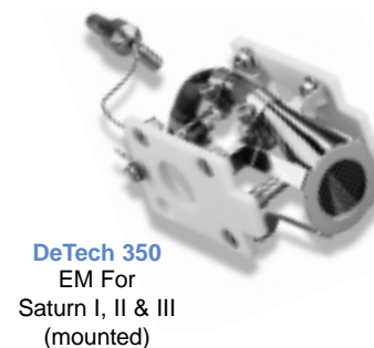
DeTech 350 EM For Saturn I, II & III (mounted)