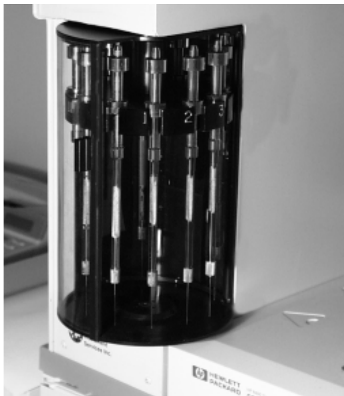
Loading of the Thermal Desorption tubes into the AutoDesorb Carousel

When the GC analysis is complete, the next sample of the ChemStation™ sequence is loaded, the GC and AutoDesorb system parameters are reset and this next sample is analyzed.