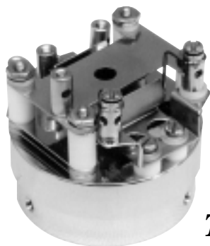
Thermo 1020/OWA Source