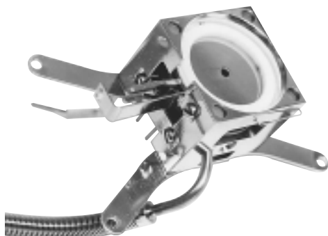
Thermo 4500/TSQ/SSQ 700 Source