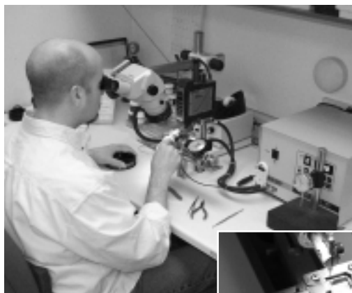
Precision Filament Manufacture and Spotwelding of Miniature Parts