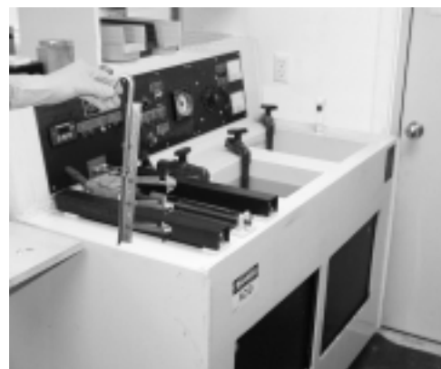
In-house finishing capabilities include electropolishing, buffing, bead blasting and hand polishing.