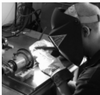
Precision TIG welding of small parts .