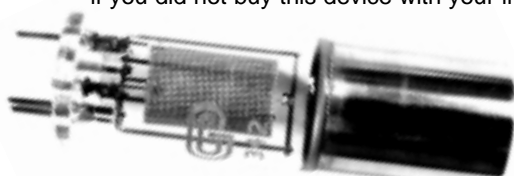
Ion Gauge Tube

The Mini Ion Gauge Tubes for the Agilent 5972/5973 MSD are available from SIS. The controller electronics and cable are available if you did not buy this device with your instrument and now wish to upgrade.