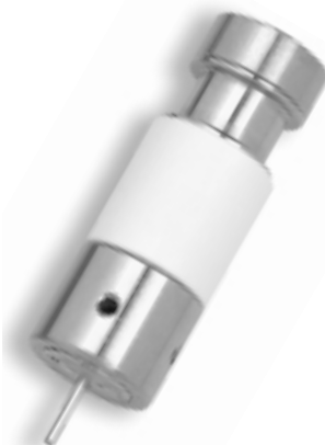
DeTech Model 2300

Electron multipliers for the HP5970 MSD are available from Burle*, ETP and DeTech. Each of the multipliers listed below comes with a manufacturer's warranty and includes installation instructions. See the electron multiplier section of these catalog for more details on each of the multipliers listed below