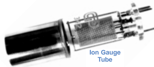
Ion Gauge Tube

The Mini Ion Gauge Tubes for the HP5972 MSD are available from SIS. The controller electronics and cable are available if you did not buy this device with your instrument and now wish to upgrade.