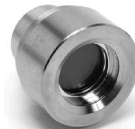
New - Multichannel plate TOF-Detectors See page A42