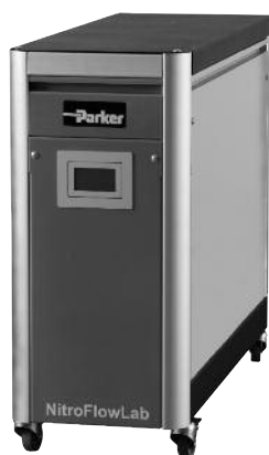
New - Nitrogen Generator for LC/MS See page D35