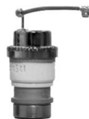
New - Multiplier Replacement for TAD for Agilent Instruments See page B6