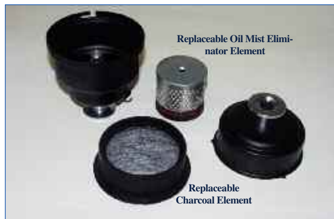
S.I.S.™ All-In-One Two Stage Vacuum Pump Exhaust Filter

The All-In-One Two Stage Vacuum Pump Exhaust Filter System has proven to be effective for removing volatile and semi-volatile organics from the exhaust of vacuum pumps and helping to maintain a safe environment. Several reports on the two stage vacuum pump exhaust filter systems are available from SIS™ in the references listed below (1, 2 & 3).